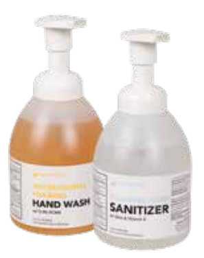
550 mL Pump Bottles

Symmetry hand hygiene products, mounted dispensers, and customizable tools that cater to your school's needs.