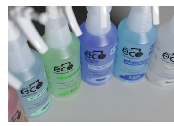
32 oz. Eco trigger spray bottles included for dispensing diluted product.